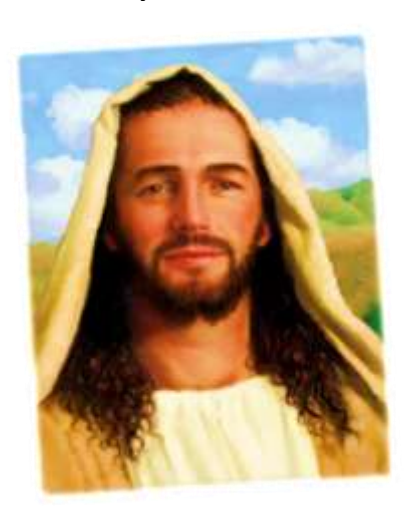
Lesson #27 How to Bury the Past

It's always easy to take a hammer and pound a nail into wood, isn't it? When you sin, it's like taking a nail and pounding it into a wall, it's easy. And it's also easy to take the claw end of the hammer and pull out the nail, but can we pull the hole out? It's easy to pull the nail out, but what about the hole? How can we get that hole out?