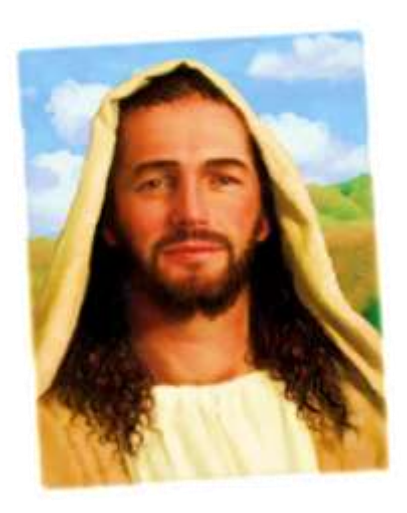
Lesson #21 The Remnant Revealed

It is unsettling to many people that there are so many Christian churches today. Many churches claim to be God's true church. Does God have a true church today? If He does, how can we identify it?